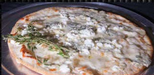
Quattro Formaggio Sm 10" $18